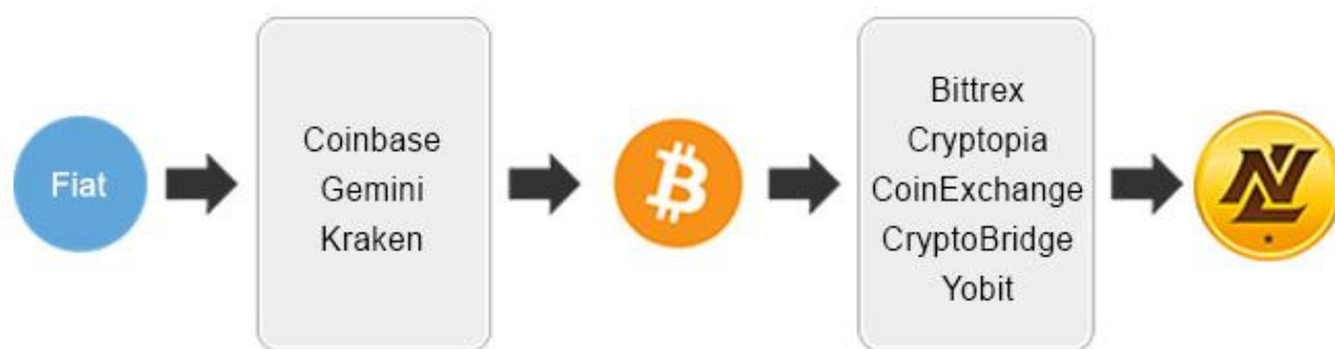
Figure 6.3: The path from fiat currency to NoLimitCoin

As of October 2017, NLC2 is traded with Bitcoin on a number of cryptocurrency exchanges such as Bittrex , Cryptopia , CoinExchange , CryptoBridge , Nova and Yobit . On major gateway exchanges such as Gemini, Kraken and Coinbase, fiat currency (e.g. USD) is used to buy Bitcoin via a bank account transfer or credit card. This can then be exchanged for NLC2 on one of the aforementioned exchanges.