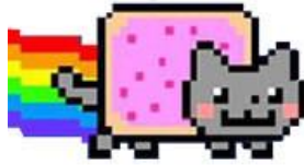
Sunerok Cryptography Developer