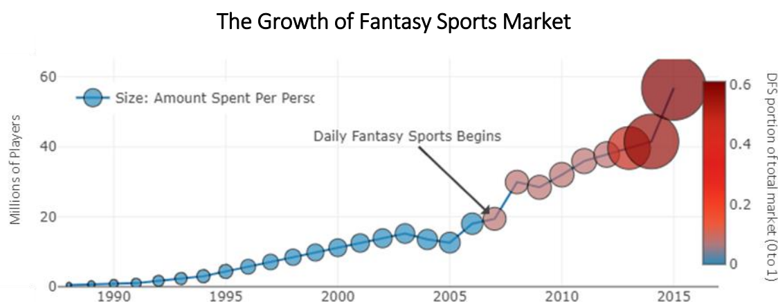
Figure 1: The Growth of the Fantasy Sports Market 5

The fantasy sports industry is one of the fastest expanding markets worldwide, growing from 12.6 million players in 2005 to 59.3 million players in 2017 in the United States and Canada alone 1 . Compared to in 2012, when players spent an average of $95 each in the U.S., the average American player spent $504 in 2017 2 . As of June 20, 2017, the fantasy sports market was valued above $7 billion 3 . Although the density of fantasy sports players in the rest of the world is lower than in America, this is a result of a lack of strong fantasy sports platforms seeing the interest in fantasy sports is there 4 .